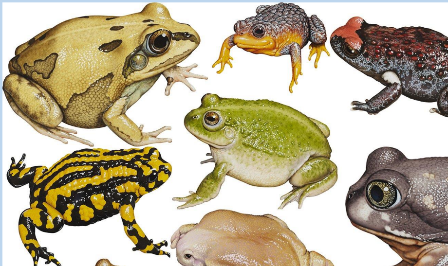
Frogs sit in a more horizontal position.