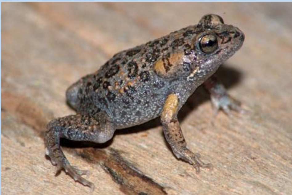
Smooth Toadlet – like a toad.