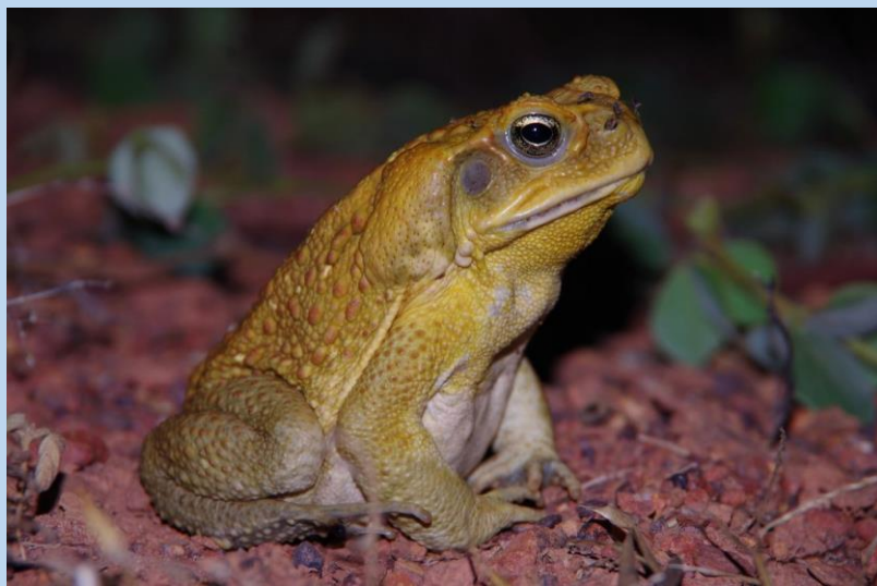
Cane toads sit up straight.