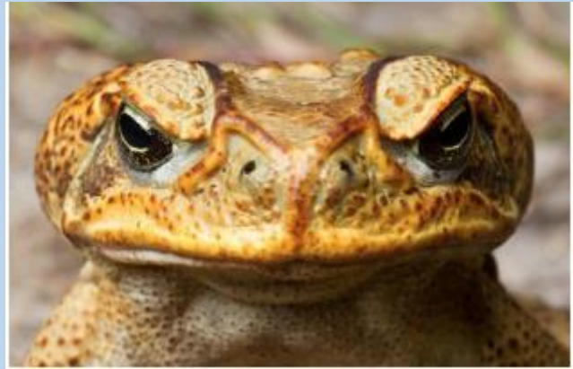
Toads have exaggerated brows, and bony ridges.