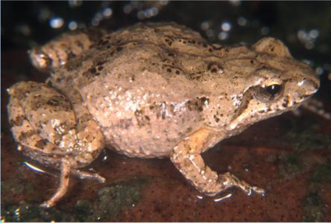
Eastern sign bearing Froglet – similar to a toad.