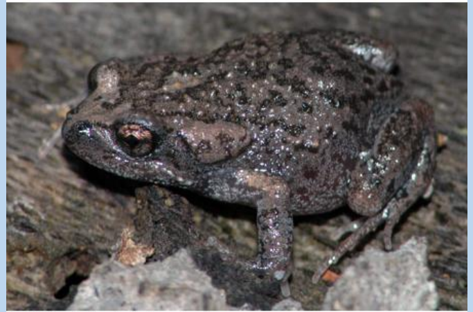
Dusky Toadlet – similar to a toad.