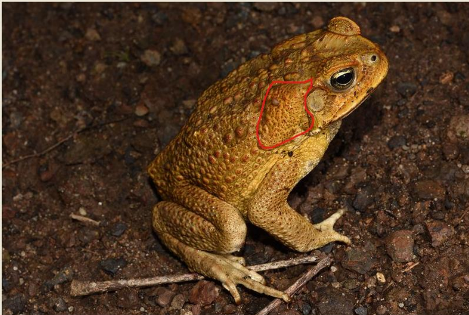
Large poison glands one gland on each side of the toad's neck.