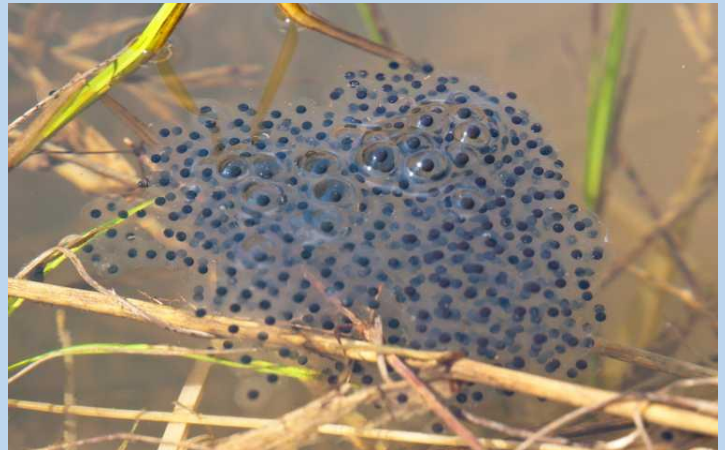
Frog eggs, in clear jelly.