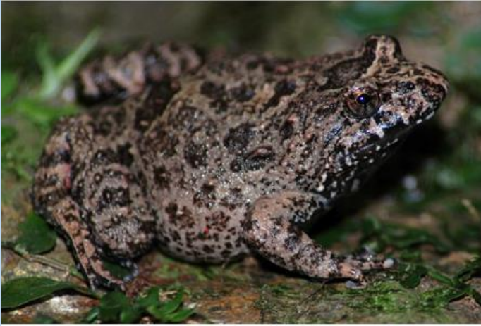
Tusked frog – similar to a toad.