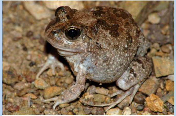
Ornate burrowing frog – similar to a toad.